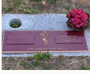
6 - IN-GROUND CREMATION LOTS AVAILABLE